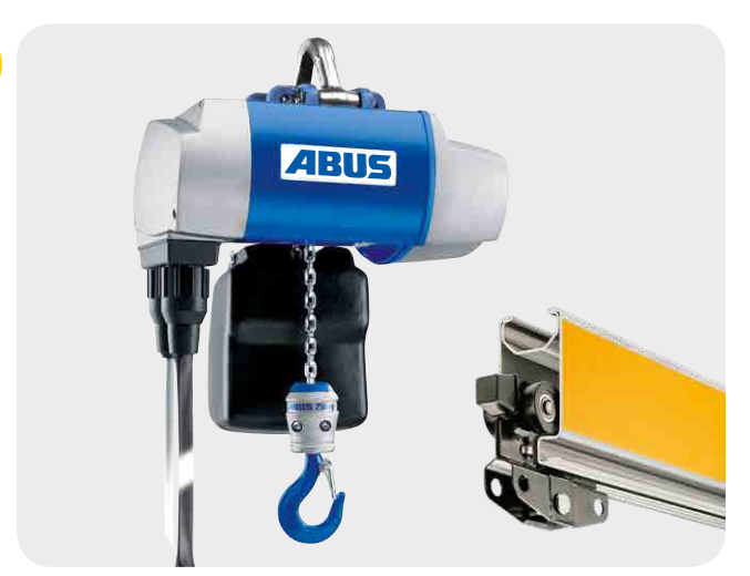
Electric chain hoist ABUCompact

Compact and load-optimised HB profile in steel and aluminium for easy handling of loads.